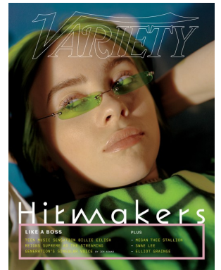
Billie Eilish