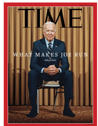
Joe Biden