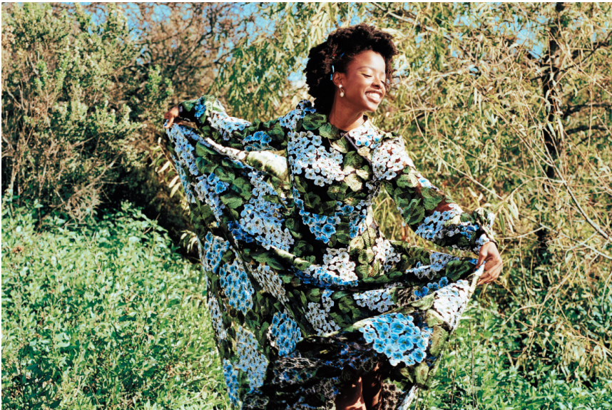
Poet Amanda Gorman